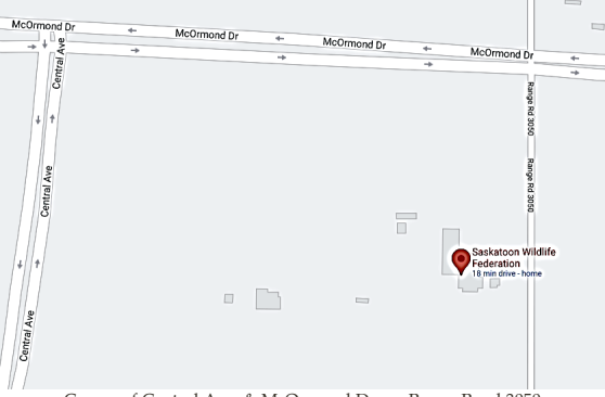
Corner of Central Ave. & McOrmond Dr. on Range Road 3050